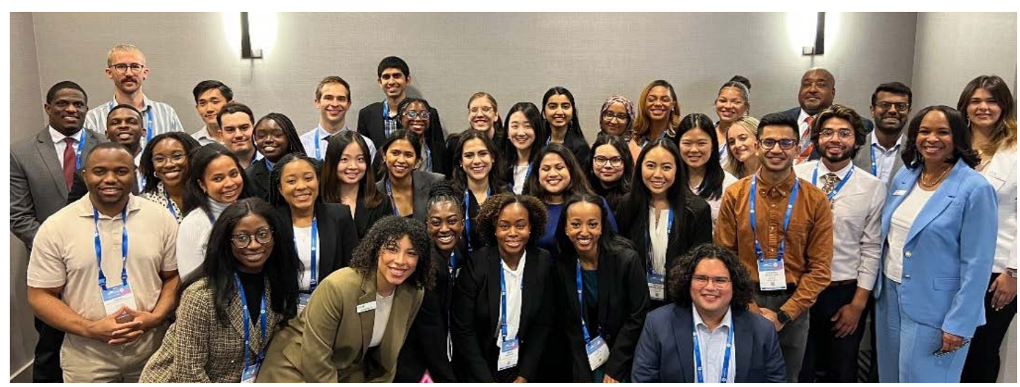
APA Annual Meeting Medical Student Luncheon: Summer Medical Student Program 2023 Cohort